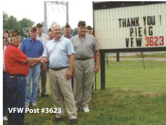
VFW Post #3623