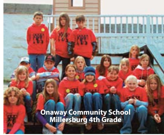
Onaway Community School Millersburg 4th Grade